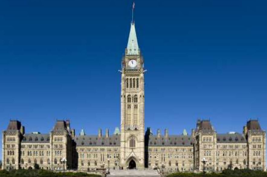
Centre Block with the House of Commons side on the left and the Senate side on the right.